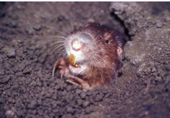
Plains pocket gopher

N orthern pocket gophers ( Thomomys talpoides ) live underground year-round in burrow systems that are often extensive and elaborate. Their range in southern Manitoba, as shown on the map on the back of this publication, includes some of our most important cropland. Their survival dictates spending warmer months collecting food to tide them over winter. Capable of surviving extremely harsh conditions, pocket gopher populations can expand rapidly when conditions are good. Unfortunately, good conditions are created when farmers grow high quality forage crops, like alfalfa, that they prefer to feed on. Pocket gophers can quickly ruin a field of alfalfa by feeding on taproots and smothering new growth with soil they push out of their burrow entrances.