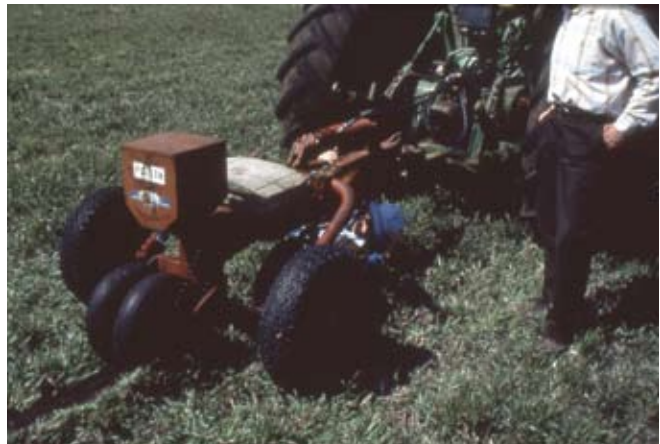
Artificial burrow builder

Many factors can influence bait acceptance and the success of a baiting program. Among them are proper bait placement, soil type, soil moisture and availability of green forage. Rotating rodenticide types can also improve success.