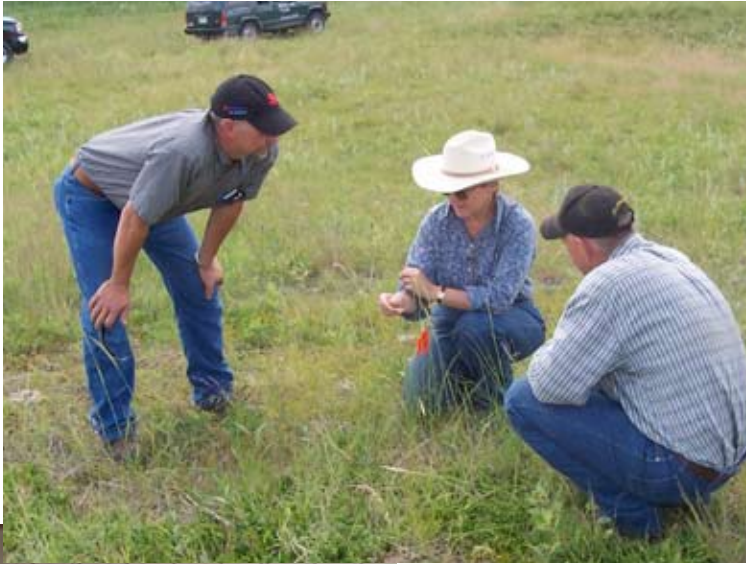
Native Range Health Workshop at Langford PFRA Community Pasture