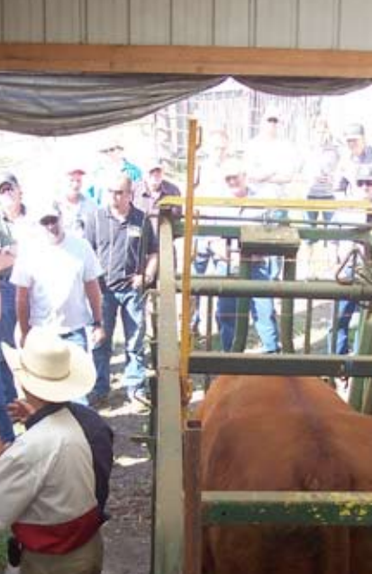
To see all Upcoming Events or learn more about Grazing Clubs go to: www.mbforage-council.mb.ca

...he looks for: fertile, healthy and easily